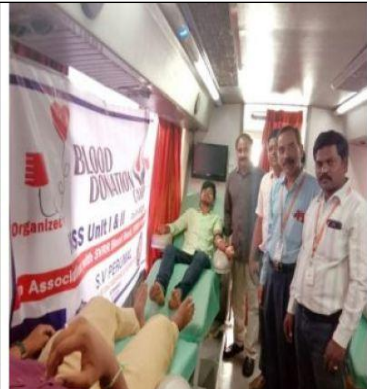
Students donating the blood