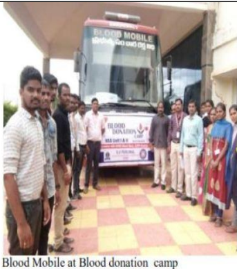
Blood Mobile at Blood donation camp